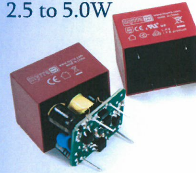
EI30 Size 2.5 to 5.0W