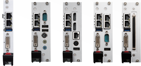
cPCI-3510(BL) cPCI-3510(BL)D cPCI-3510(BL)G cPCI-3510L cPCI-3510M